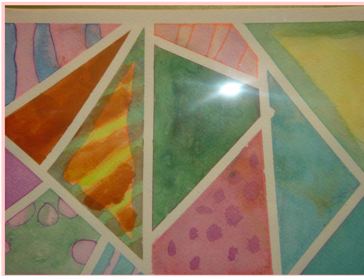
MACKENZIE HOWSE Grade 3