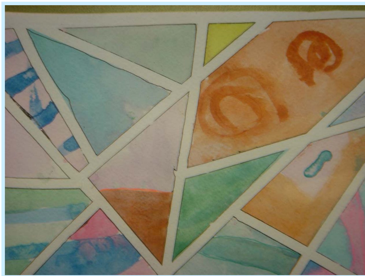
SUKMIT TOOR Grade 3