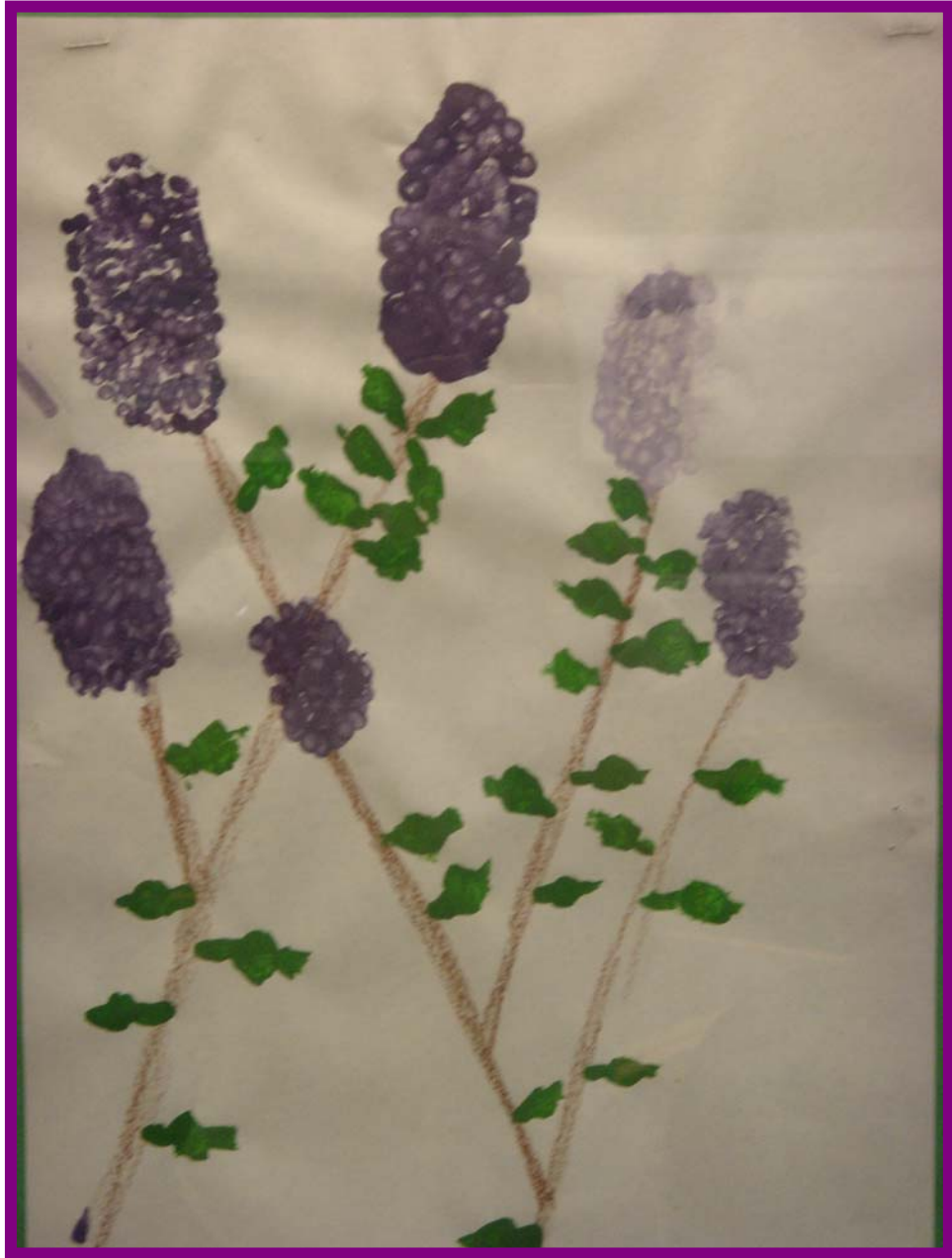
TOMMY MANSELL Grade 3