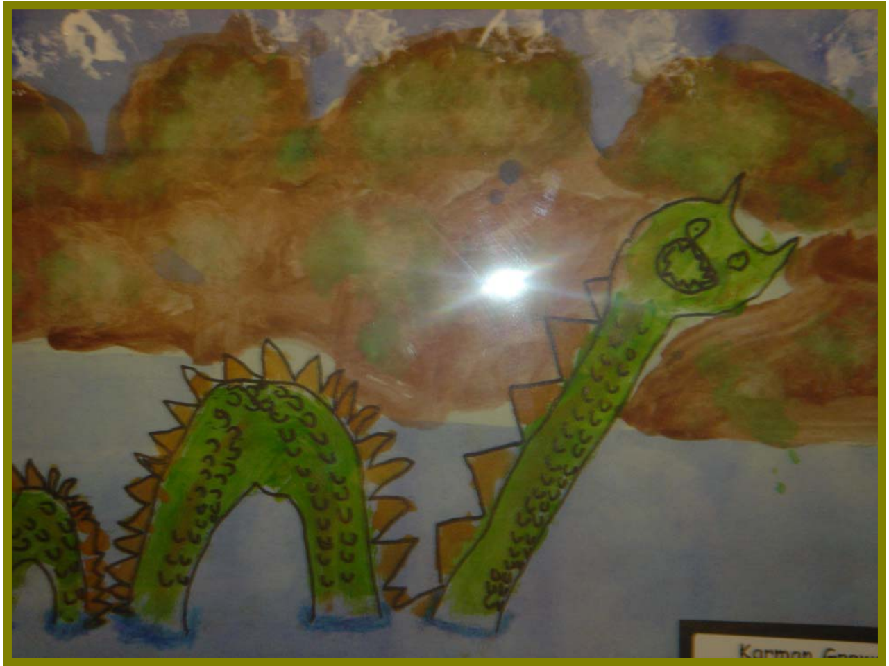
KARMAN GREWAL Grade 1