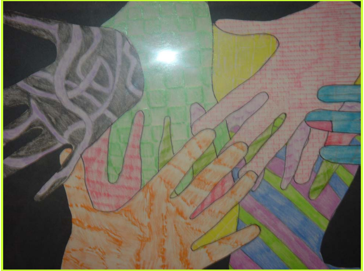
Mickella Dilorewzo-Biggs Grade 6