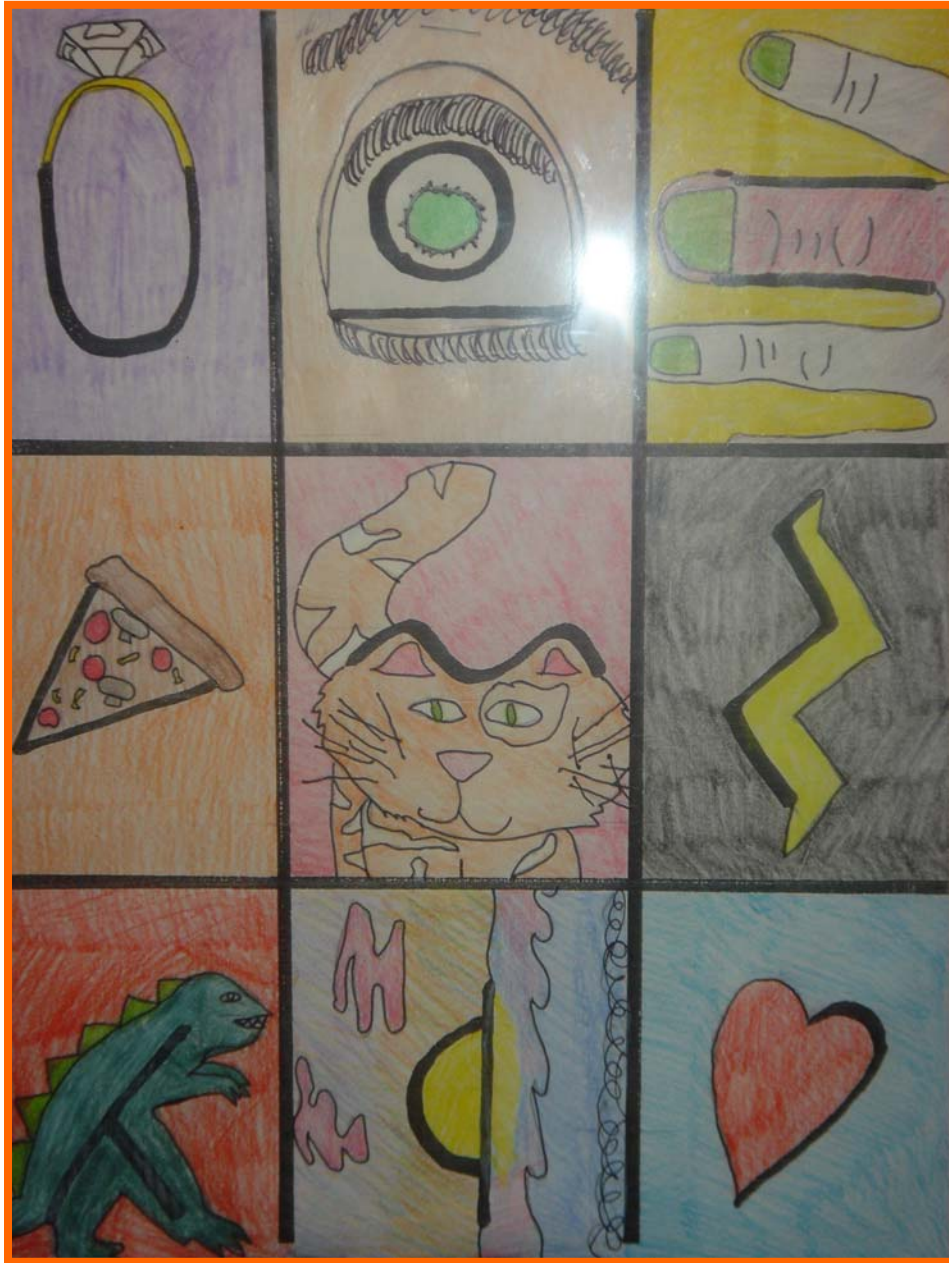
Mickella Dilorewzo-Biggs Grade 6