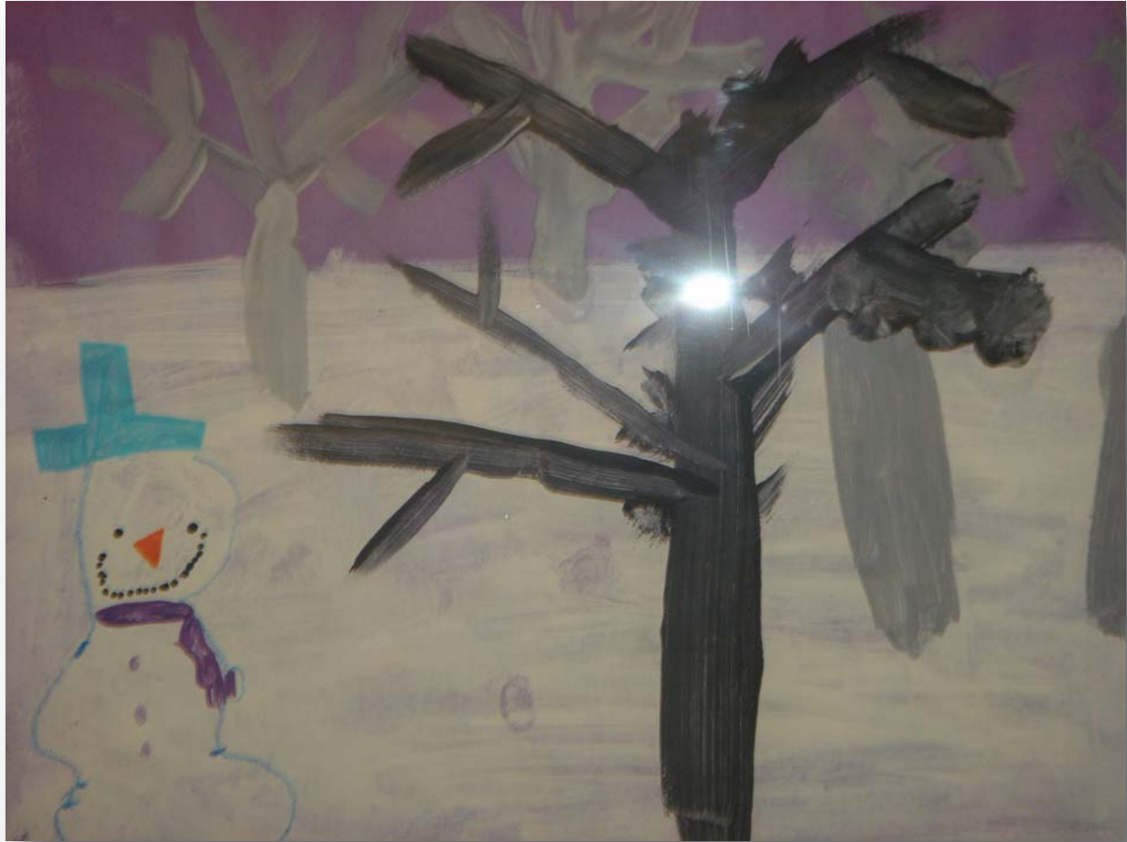
Ava Wall Grade 1