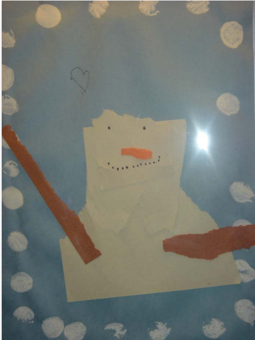
Nevaeh Dyson Kindergarten