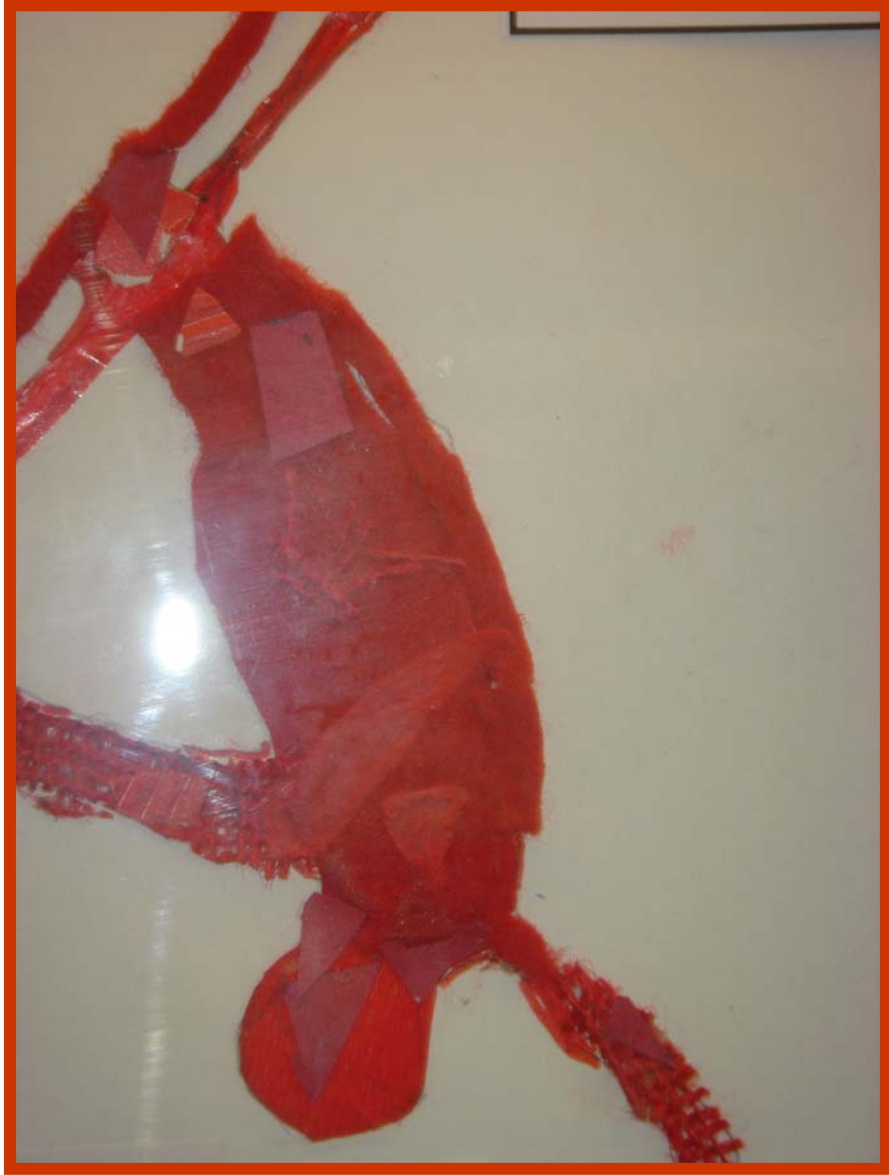
SHANNON ROBINSON Grade 3