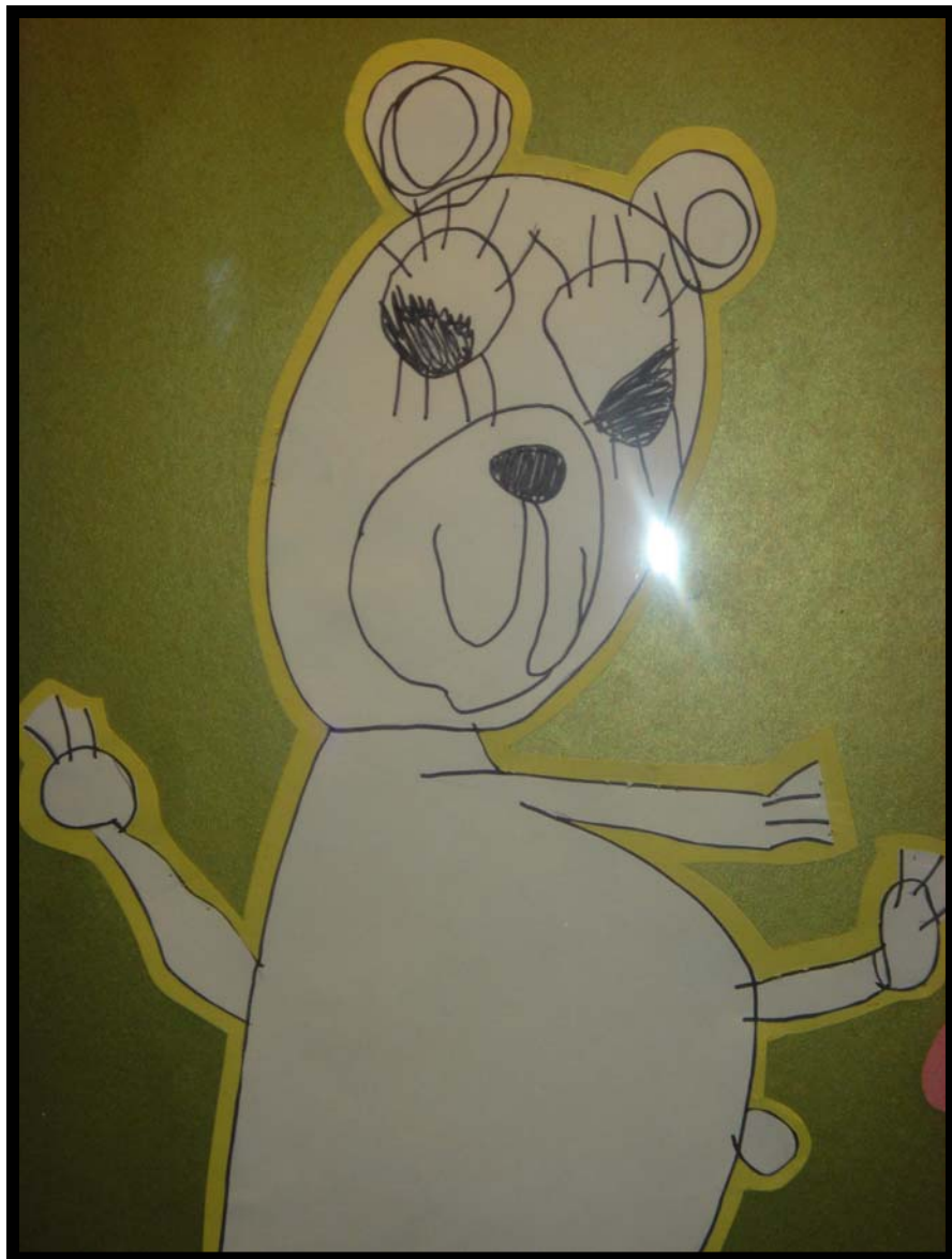
RACHEL BROWN Kindergarten