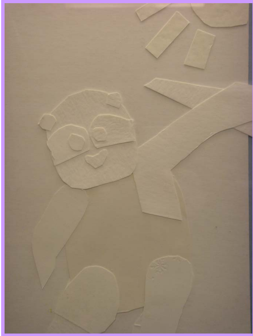
MACKENZIE SMITH Grade 5