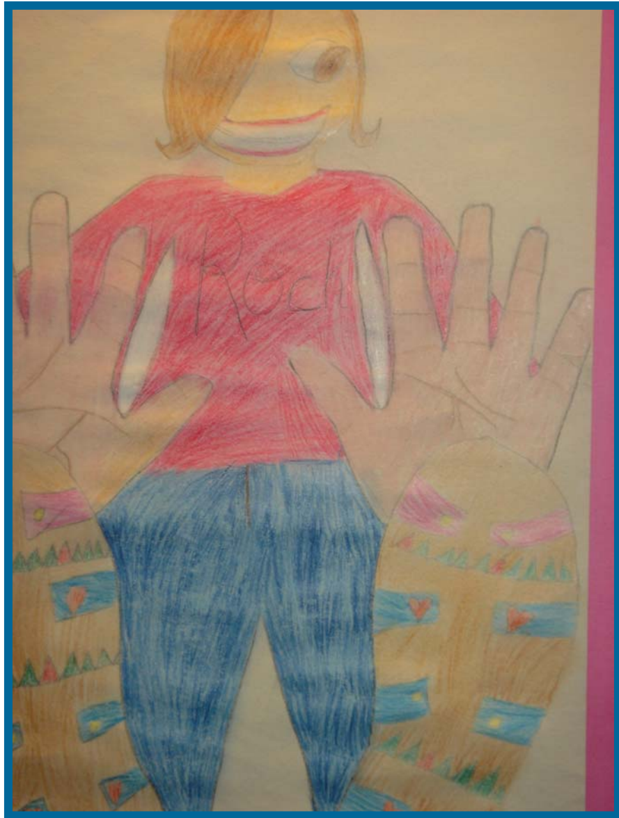
TAYEDRA KOPPE Grade 4