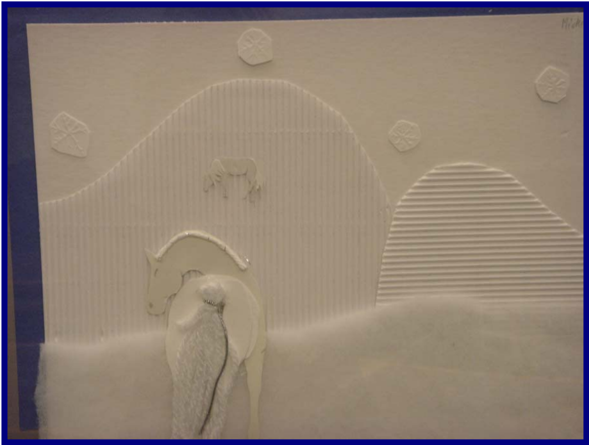
MICHELLE MILES Grade 5