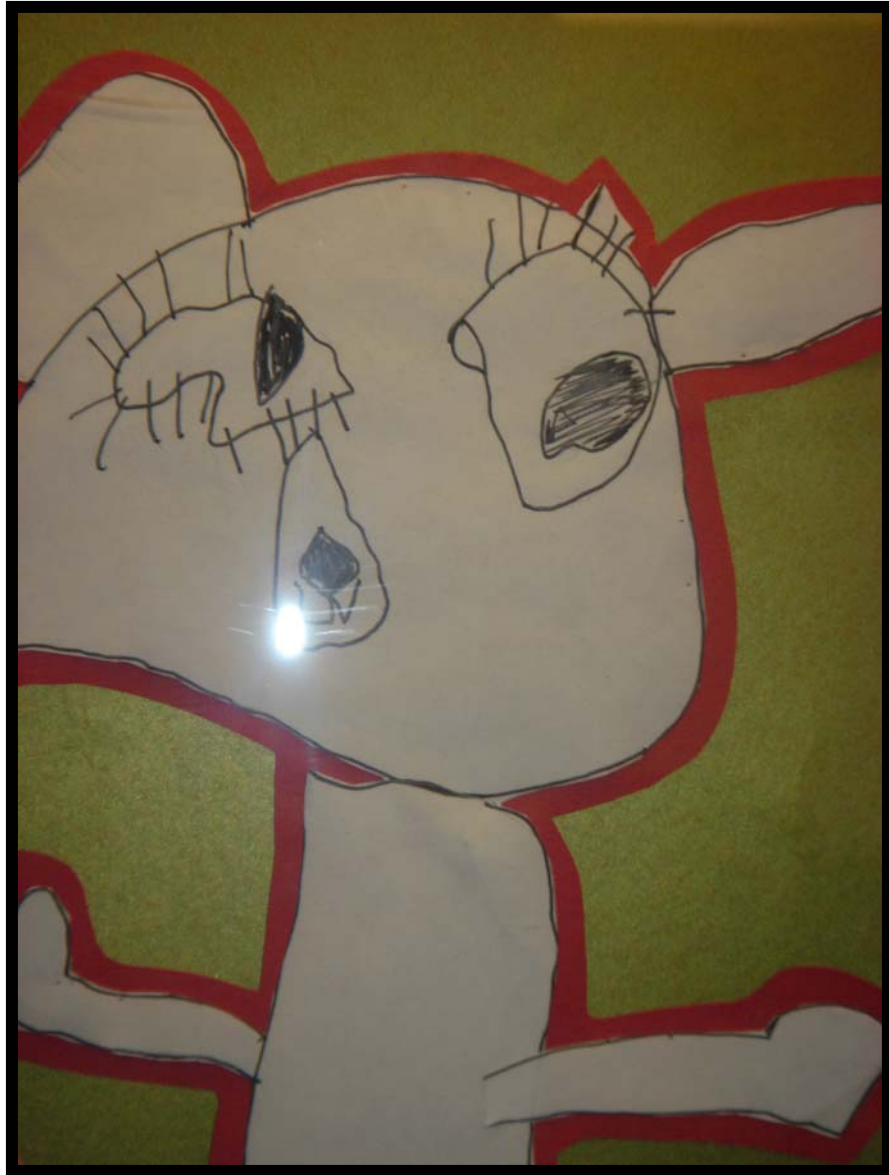
LUCAS BYRNE Kindergarten