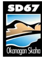
Skaha Lake Middle Continued...