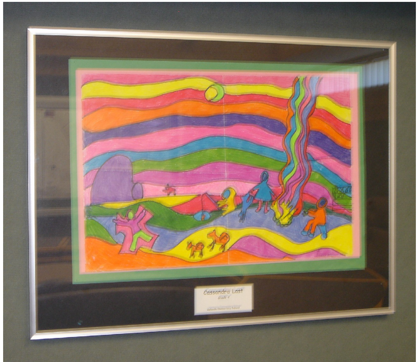
Cassandra Last Grade 4 Uplands Elementary School