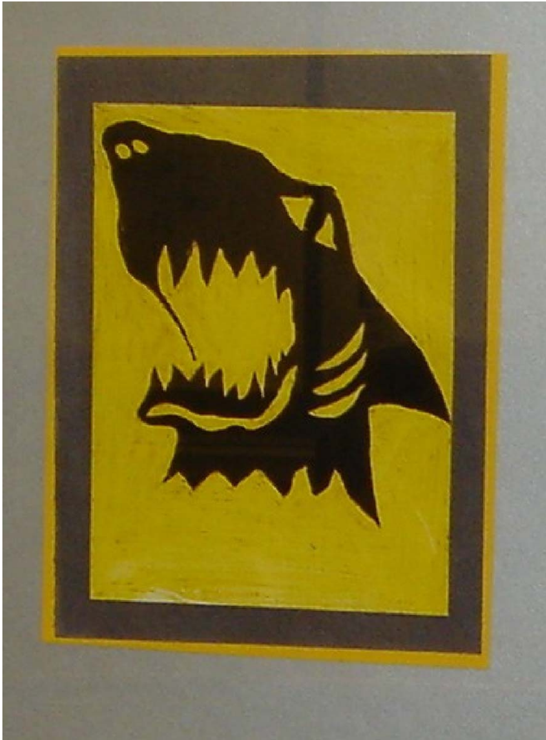
Albion Bunjaku Grade 8