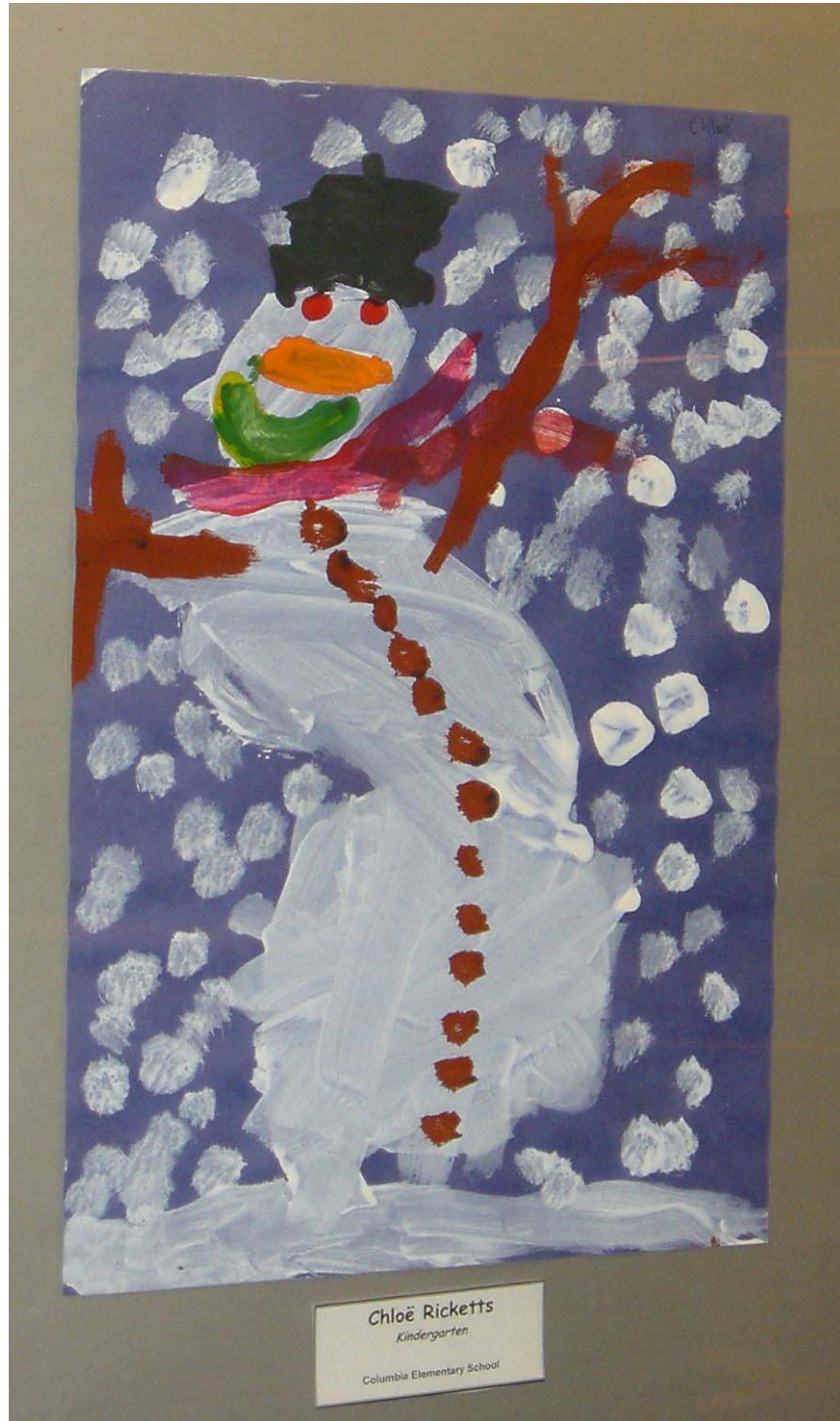
CHLOË RICKETTS Kindergarten