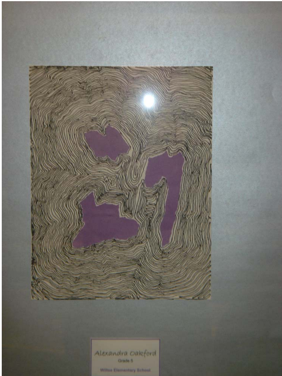
ALEXANDRA OAKFORD Grade 5