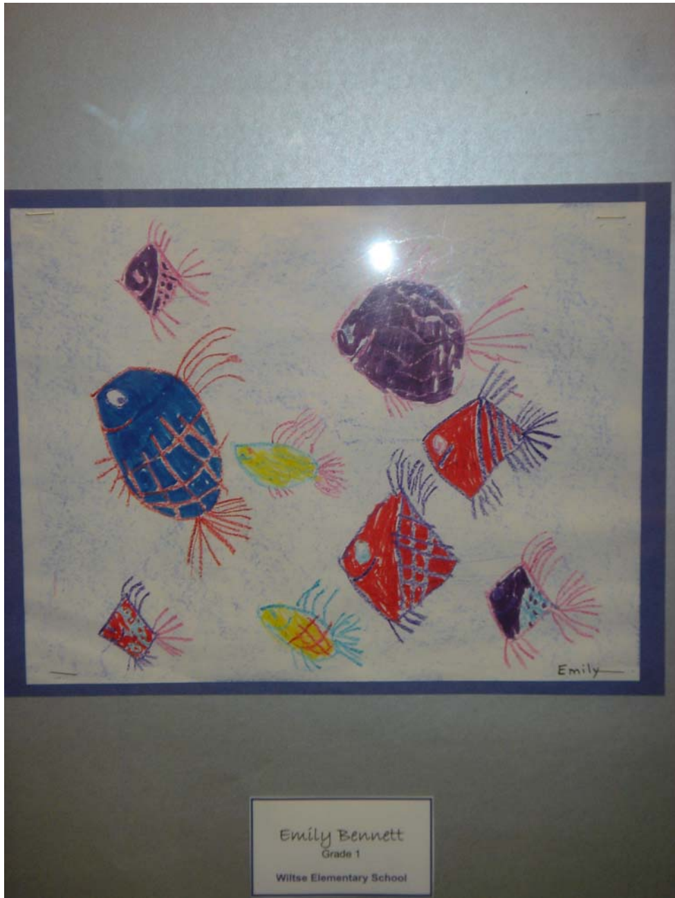
EMILY BENNETT Grade 1