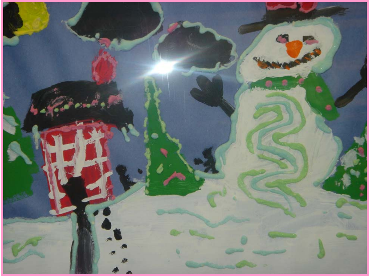
REAGAN SHORROCK Grade 3