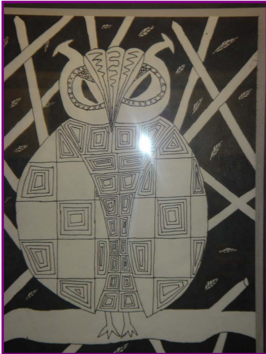
KOLTEN PHIPPS Grade 5