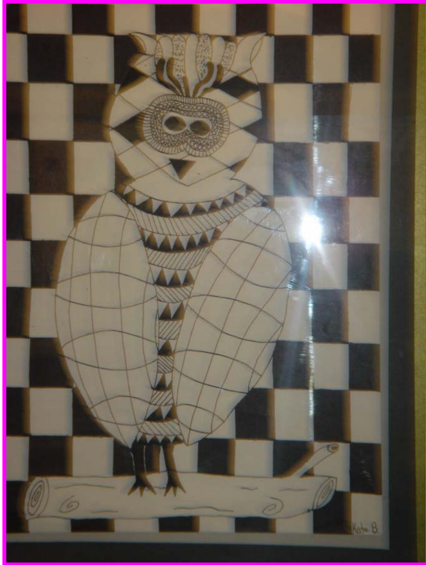
KATE BYRNES Grade 5