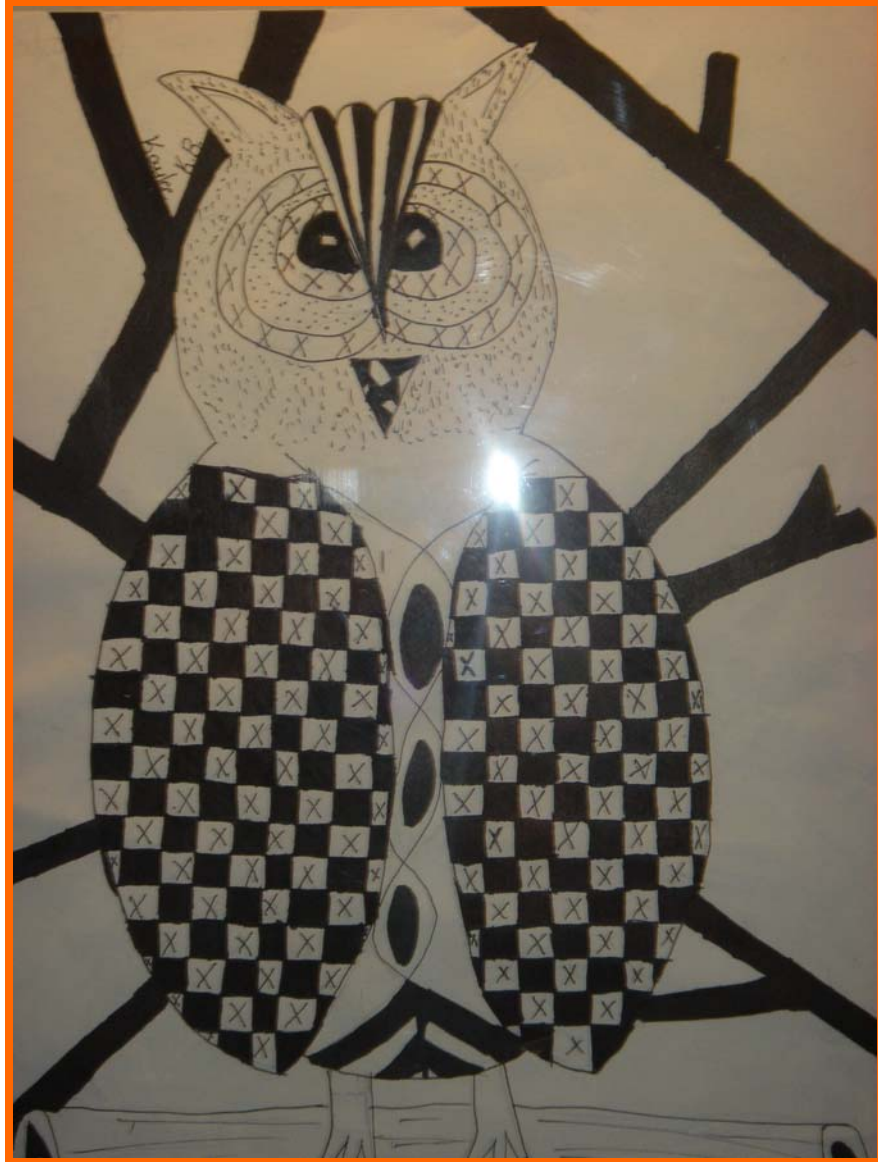
KAYLEE KOZARI-BOWLAND Grade 5