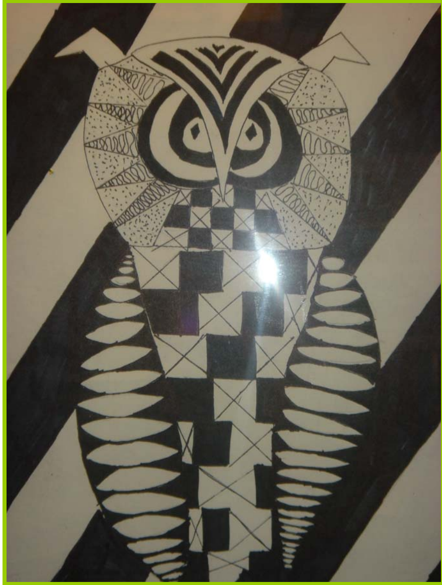
LEAH WATTS Grade 5