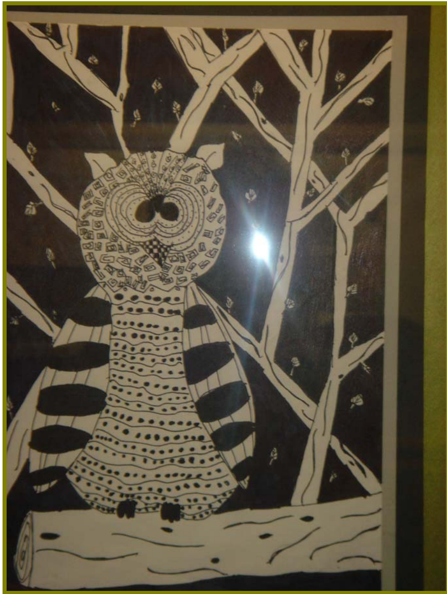
MARLEY NAMETH Grade 5