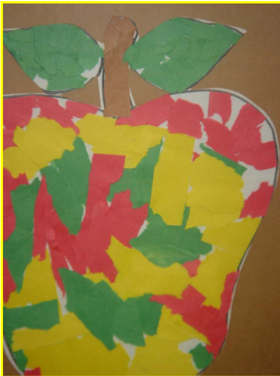
ALEXANDRA WEBB Kindergarten