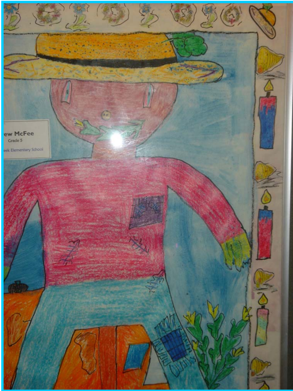
DREW McFEE Grade 5