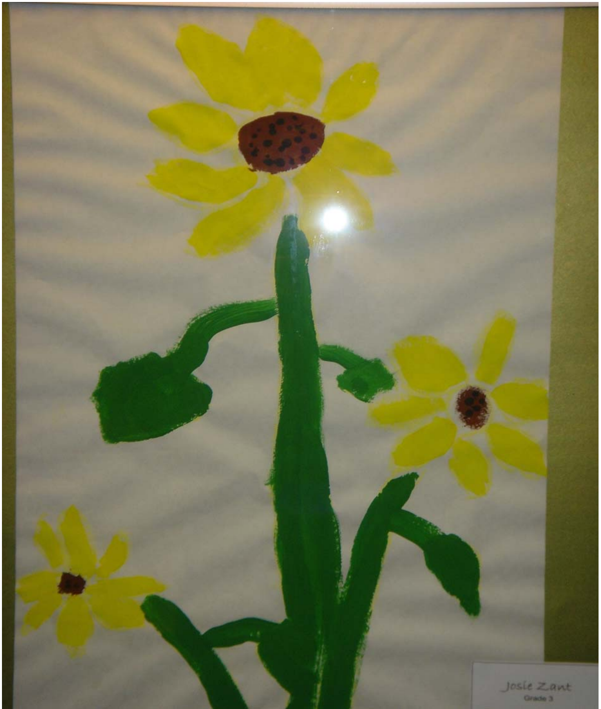
JOSIE ZANT Grade 3