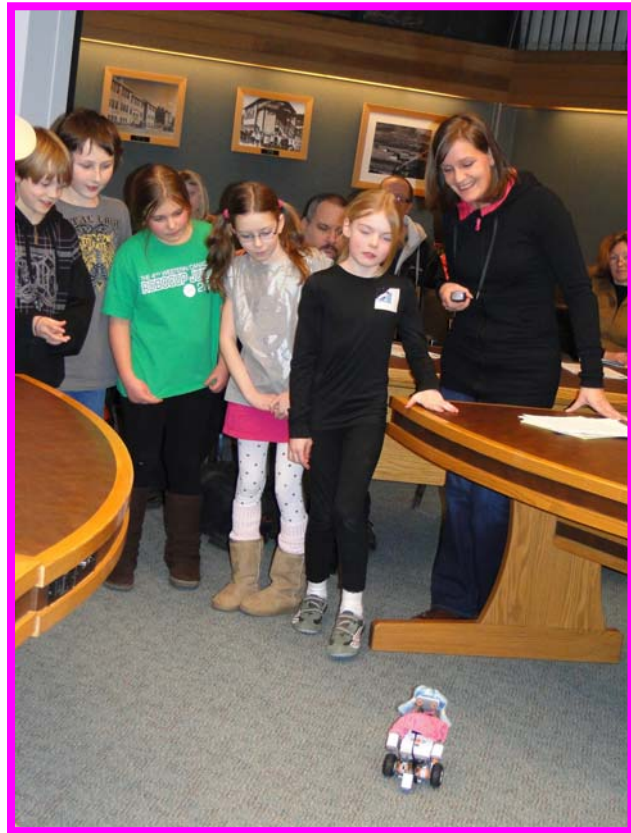
Naramata Elementary Students