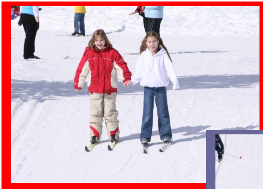
Grade 5's Cross-country Skiing at Nickel Plate