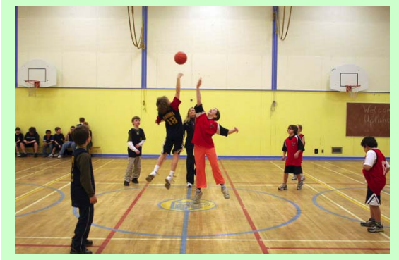
Basketball in Action