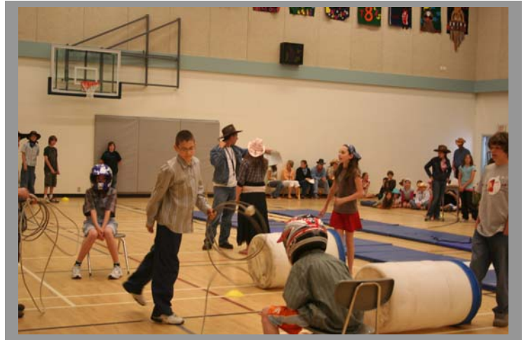
Western Days at Summerland Middle