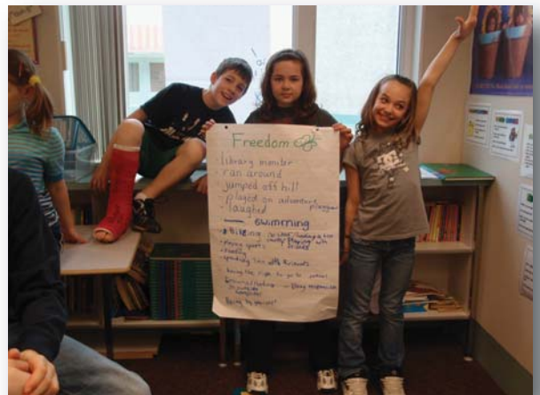
RESTORATIVE PRACTICES in ACTION