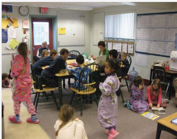
Annual PJ & Buddy Read

Older students were partnered with younger students to share literature.