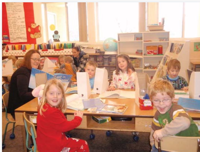
Family Literacy Day