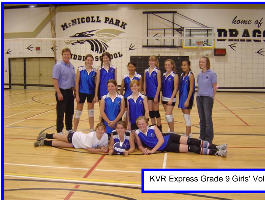
KVR Express Grade 9 Girls' Volleyball Team