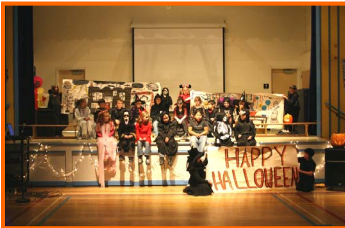
Halloween Assembly ~ October 31st