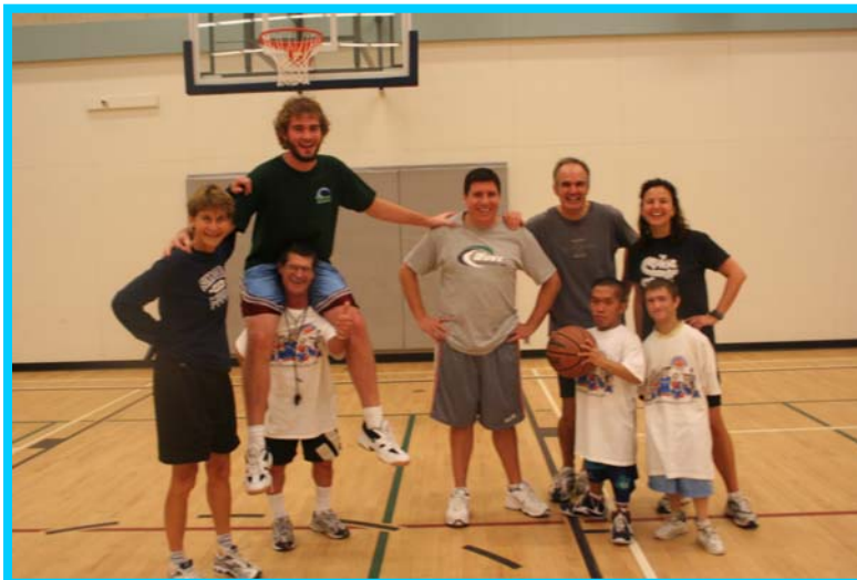
Canadian Half-Pints pose with the staff team.