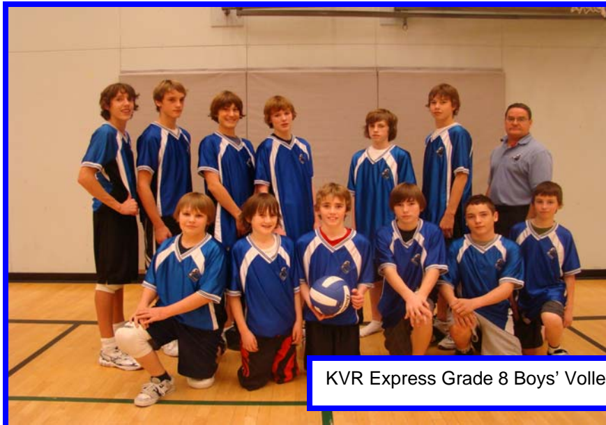
KVR Express Grade 8 Boys' Volleyball Team