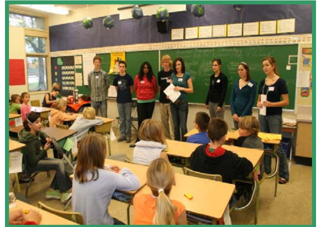
Princess Margaret Secondary Student Leaders presenting: Random Acts of Kindness & Pay it Forward