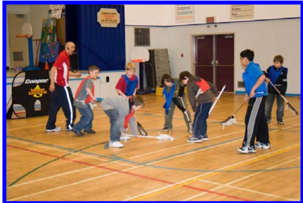
LaCross Instruction and Activities