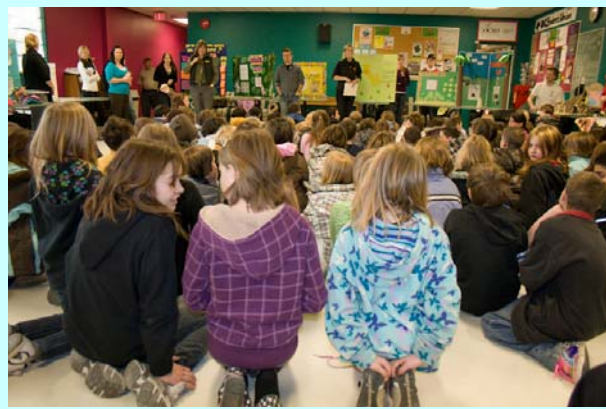
Math Fair Okanagan College