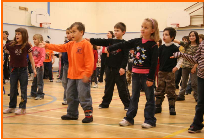
Action Schools Program Whole – School Exercise and Fun!