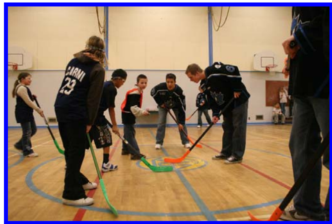
Veas Read & Succeed And Floor Hockey