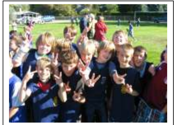
Carmi students at Trout Creek Pumpkin Run October 6 th .