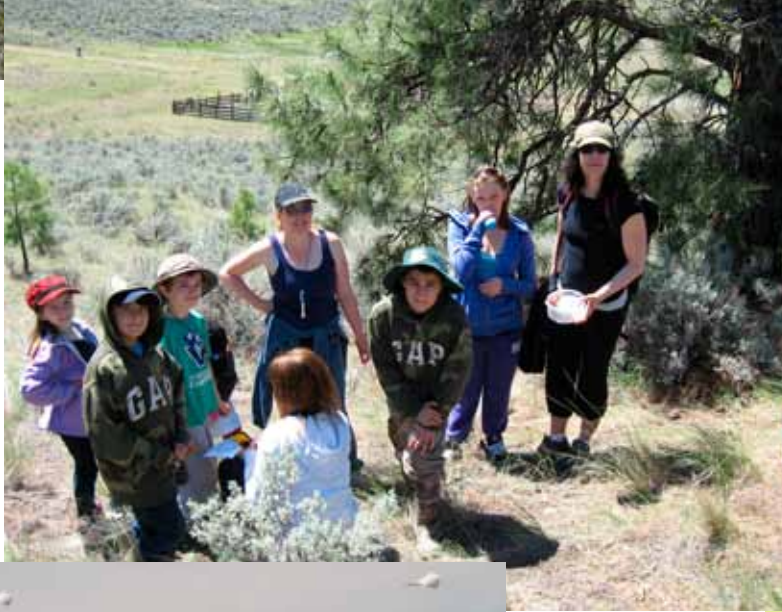
HLP Geocaching / Fossil Hunting Day at White Lake