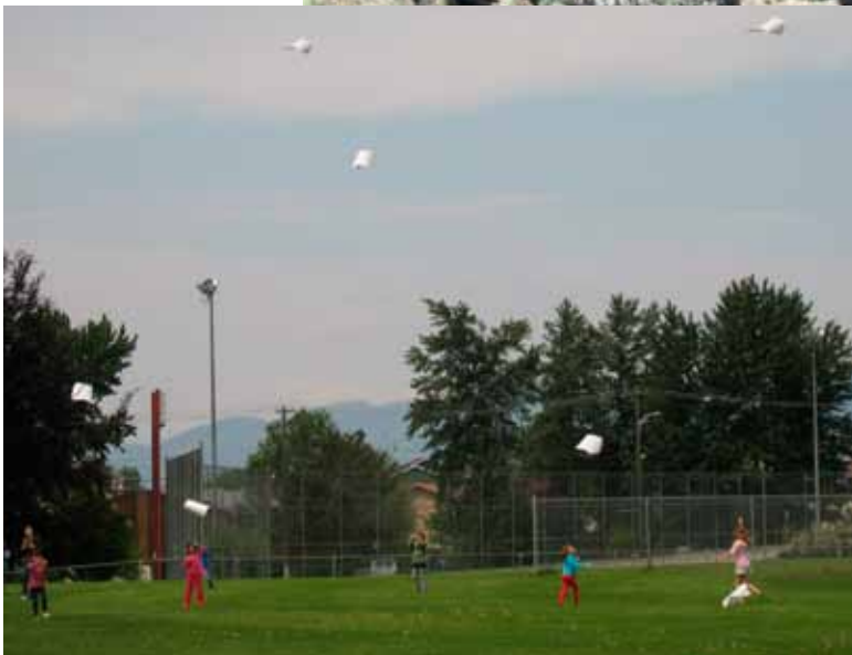
Kite Making (HLP Monday Class)