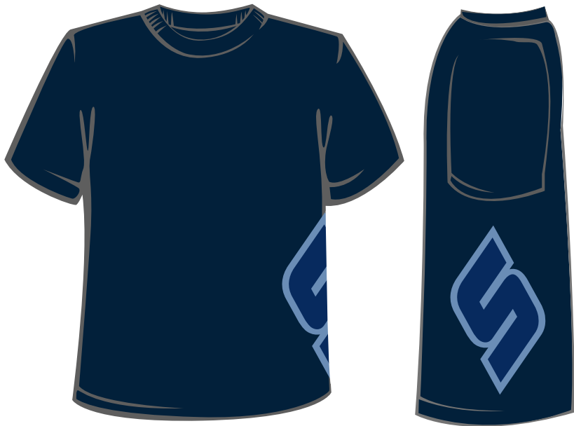
BLACK ZORREL DRI-BALANCE T-SHIRT